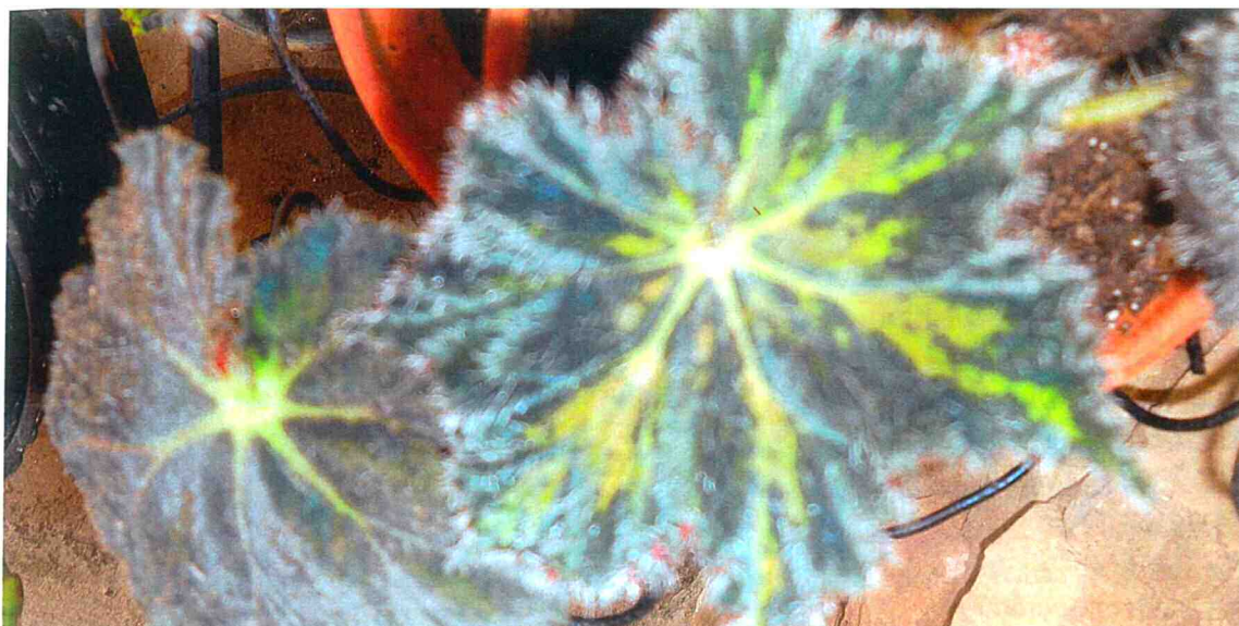
Begonia 'Brad Thompson'