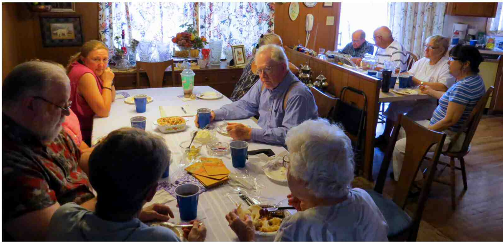
Socializing over brisket and cobbler