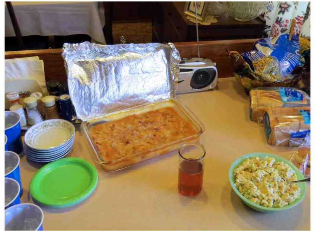
Nelda's homemade peach cobbler