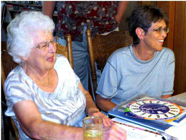
The Hummingbird Lady