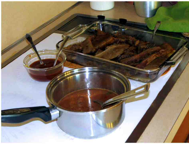
Barbecued brisket for lunch