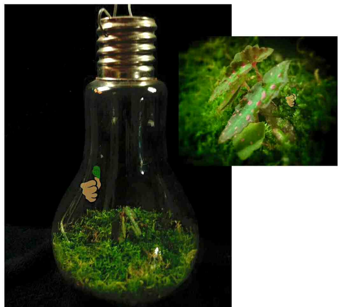
Interesting terrarium -- B. amphioxus in a lightbulb, created by Kenneth Tham (Facebook)