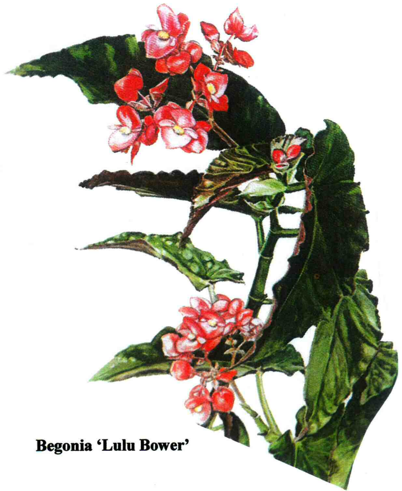
Begonia 'Lulu Bower'