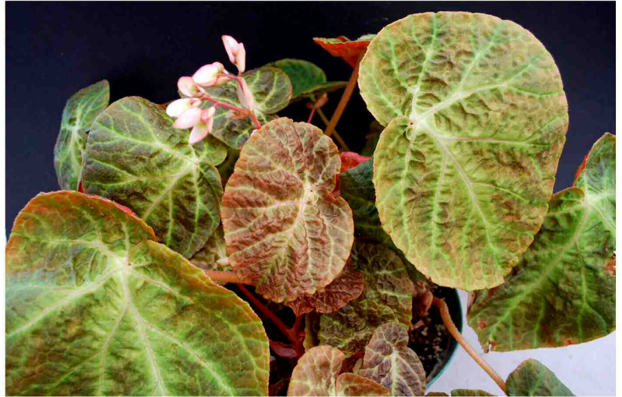
B. 'Constant Comment'