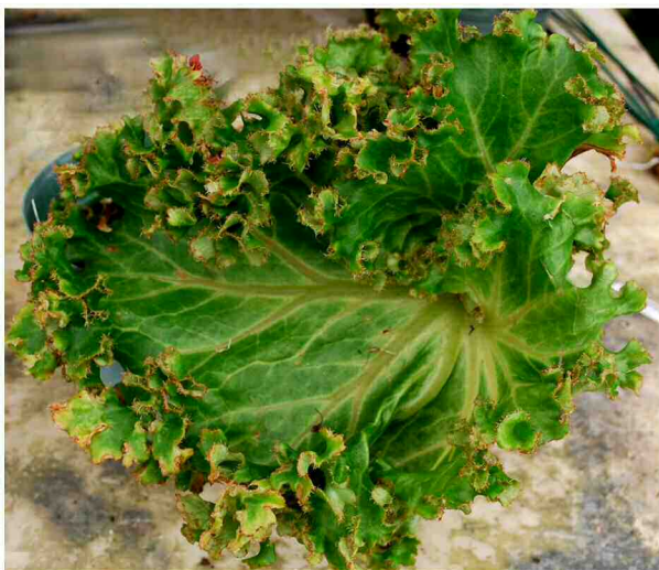
B. 'Palomar Crest'