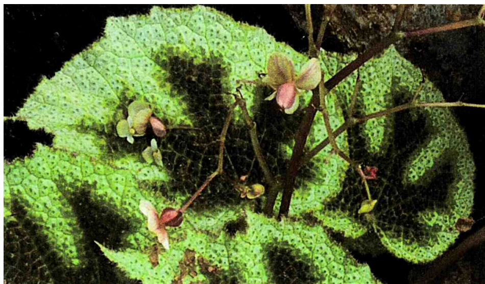
BEGONIA MASONIANA (IRON CROSS BEGONIA)

Begonia masoniana is somewhat difficult to grow. As a rhizomatous begonia it needs a potting mix with additional perlite and mulch to provide excellent drainage. This begonia should be kept somewhat moist, but it needs to dry out between waterings; however, it is not good for the soil to be too dry. It can have root rot in the summer if it is too wet.