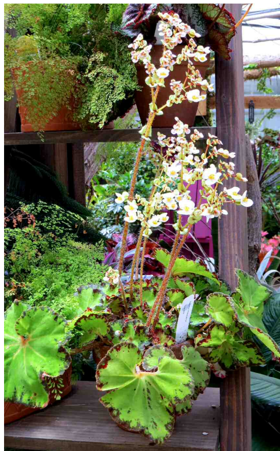
B. River Nile