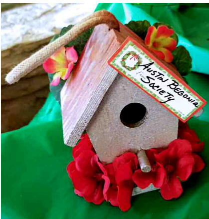
The 2017 Austin Area Begonia Society Christmas Tree on display in the Green Room