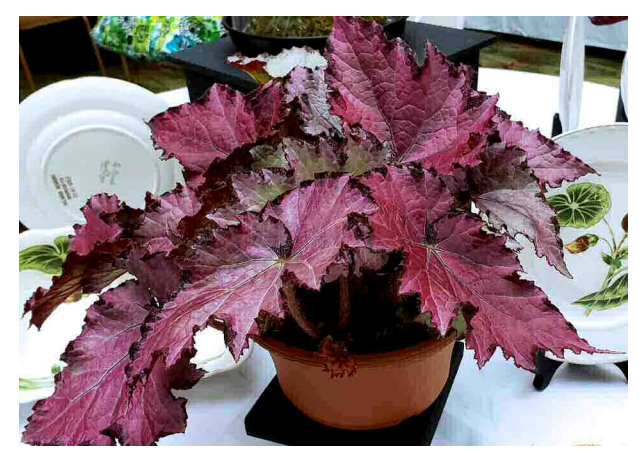
B. 'Champagne Bubbles'