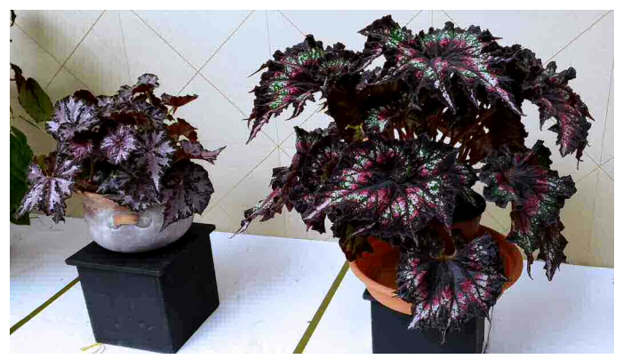
B. 'Dejah Thoris' and B. 'Phantom'

Steve's Leaves, a commercial grower, brought B. 'Cosmic Candy,' B. 'Phantom,' and B. 'Dejah Thoris.' As usual the Fort Worth Botanic Garden provided an excellent exhibit with a display board and many begonias.