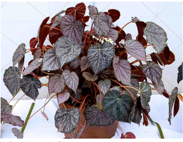
B. 'Passing Storm'

In all Pi brought 20 plants including B. 'Plum Gorgeous.'