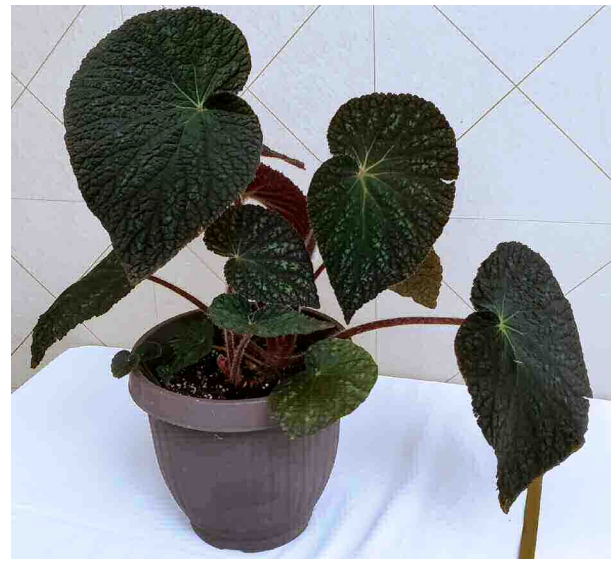
B. 'Emerald of Siam'

Freda Holley showed B. 'Emerald of Siam,' a rhizome jointed at below soil with erect stem.