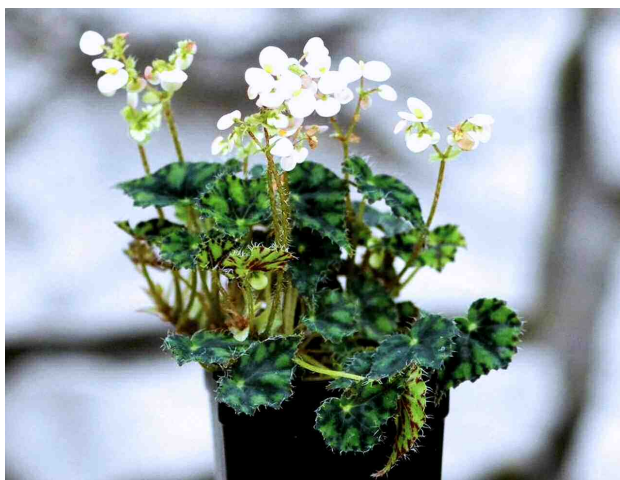
B. 'Rhinestone Jeans'