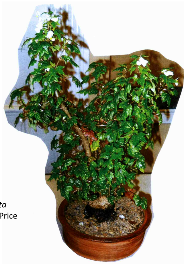
Photograph of B. partita Show Plant by Bobbie Price