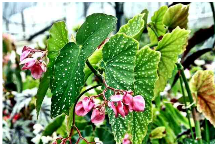
B. 'Sylvan Triumph'