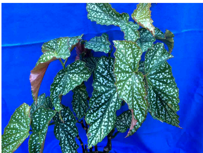
B. 'Sylvan Triumph'