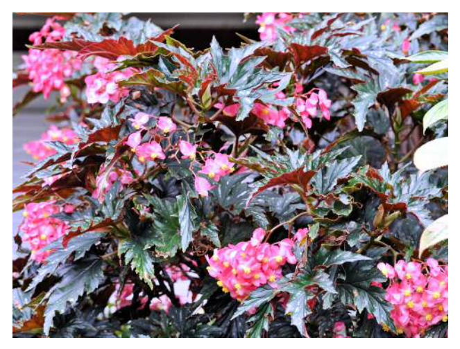
B. 'Sophie Cecile'

thick-stemmed species. B. leathermaniae has a ruff-like collar of flattened hairs at the top of the petiole while B. platanifolia has shorter ovate leaf lobes without silver markings.