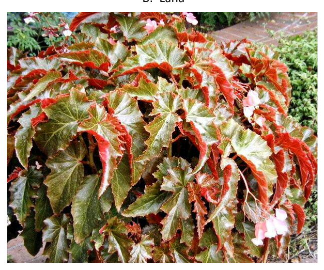
B. 'Pink Jade'

the silver-splashed palmate-lobed leaves. To grow these water only when the surface of the plant's growing medium is dry or the plant will drop its leaves. Stop fertilizing and reduce watering while the plants are dormant.