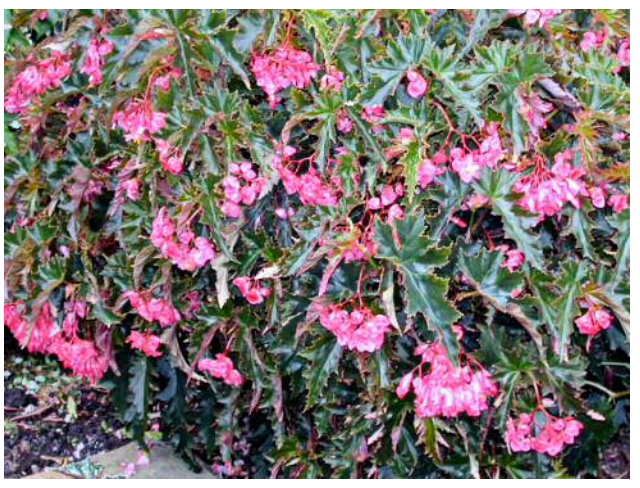
B. 'Irene Nuss'