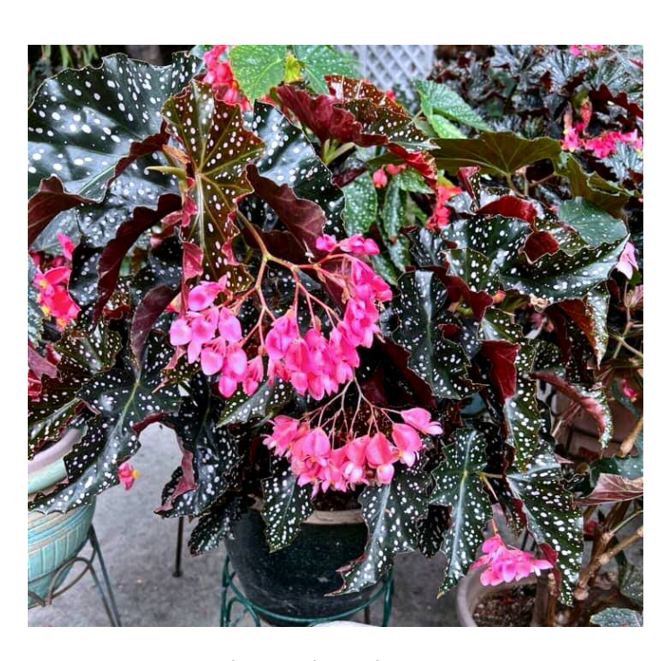
B. 'Cracklin' Rosie' Superba