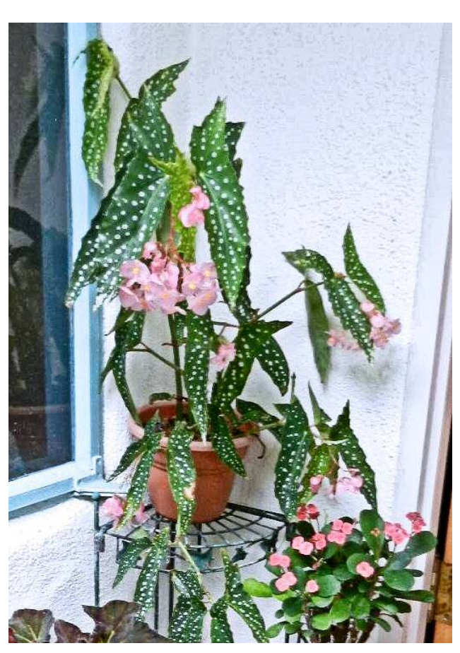
B. 'My Special Angel'