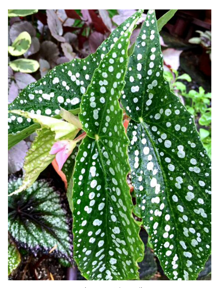
B. 'My Special Angel'