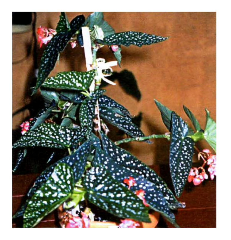
B. 'Peggy's Pet'