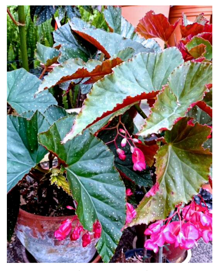
B. 'Corallina de Lucerna'