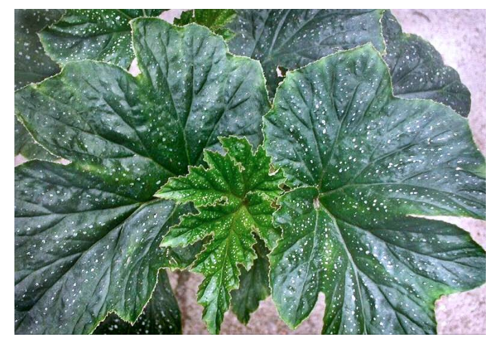
B. 'Holley's Heartfelt' - 2000 cane-like