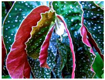
B. 'Holley's Falcon' - 2003 cane-like