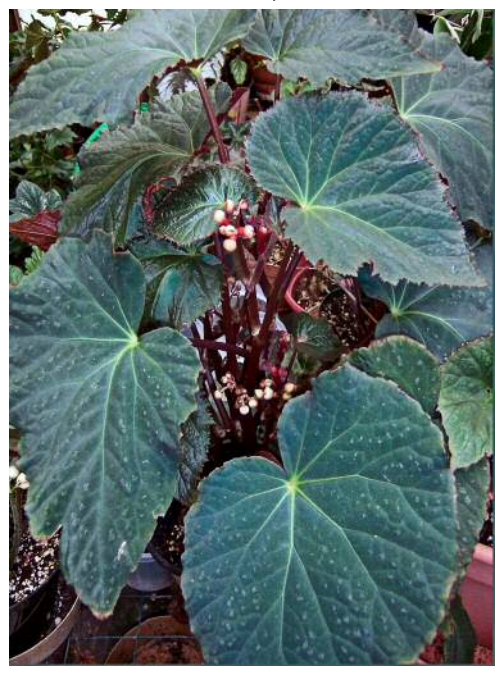
B. 'Freda's Mystery' - 2015 rhizomatous