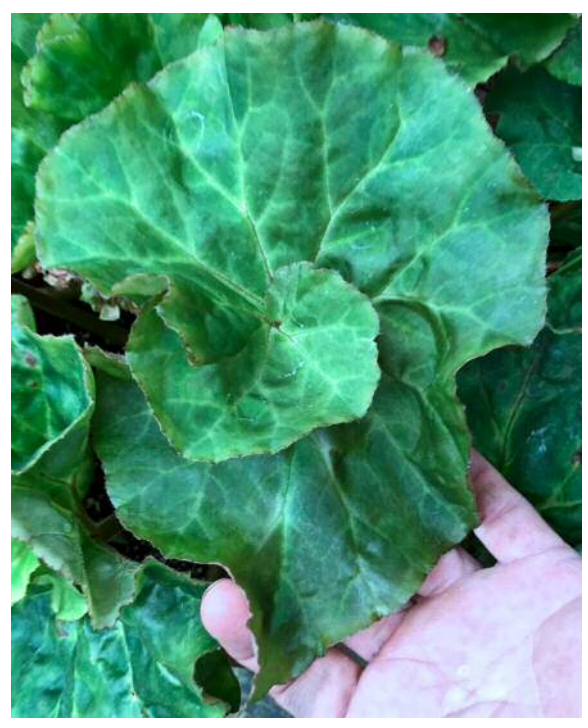
B. 'Holley's Beauty' - 2004 rhizomatous