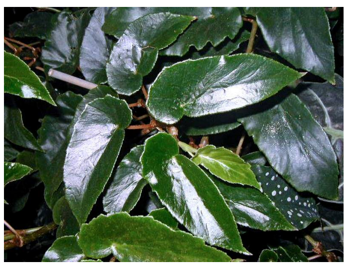
B. Holley's Heron' - 2000 shrub-like