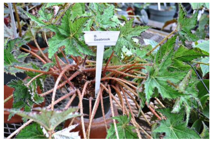
B. 'Seabrook' - 2012 rhizomatous