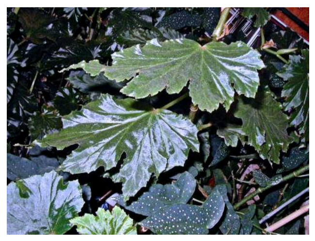
B. 'Caliph' - 2003 cane-like superba

Some of her hybrids include B. 'Alley Cat,' a rhizomatous, B. 'Almost True,' a cane, B, 'Caliph,' a superba cane, B. 'Dickens,' a shrub, B. 'Dovecot,' a semperflorens, B. 'Freda's Mystery,' an upright rhizomatous, and B. 'Gideon,' a thick stem. These are only a few of the deeply loved begonias she has created.