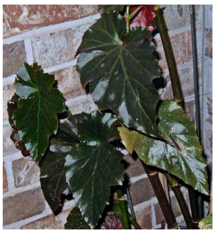
B. 'Holley's Green Giant' - 2000 rhizomatous