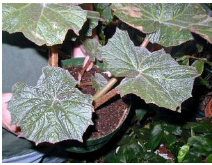
B. Holley's Blues - 2000 rhizomatous