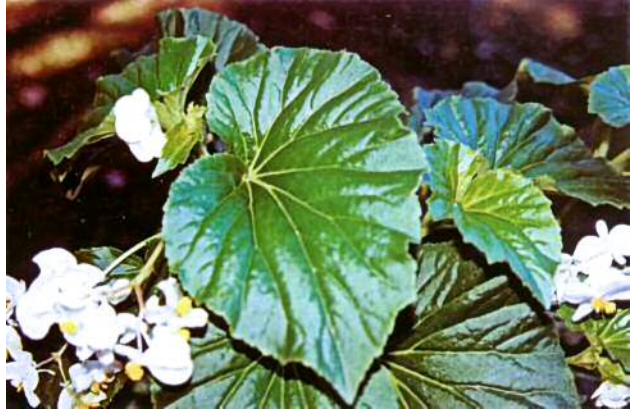
B. 'Dovecot' - 2000 shrub-like

Some others are B. 'Holley's Beauty,' B. 'Holley's Blues,' B. 'Holley's Dark Night,' a cane, B. 'Holley's Falcon,' B. 'Holley's Gem,' B. 'Holley's Green Giant,' B. 'Holley's Heartfelt,' B. 'Holley's Heron,' B. 'Holley's Skyscraper.' Then there are many hybridized in Louisiana, some with names of birds until 15 years later she ends as of today with a waltz and B. 'Miss Louisiana.'