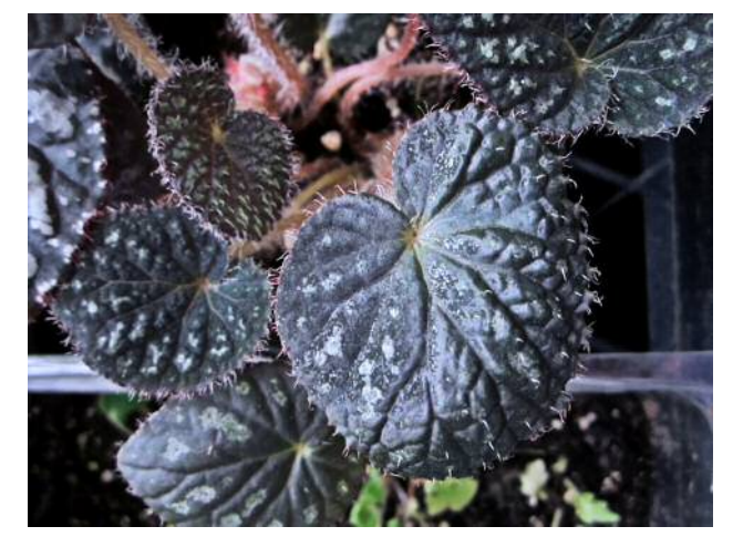
B. Emerald of Siam - 2018 rhizomatous