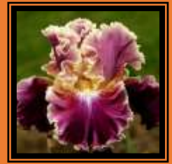
2017 Dykes Medal Winner