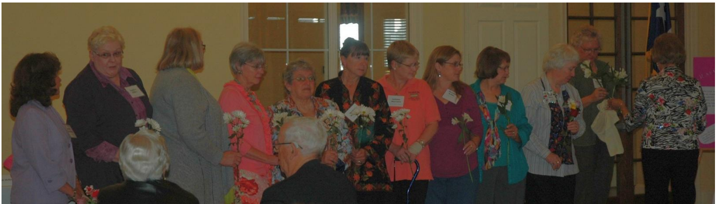
The newly installed 2013 -2015 District V Executive Board

In the July issue of the District V Newsletter you will find: