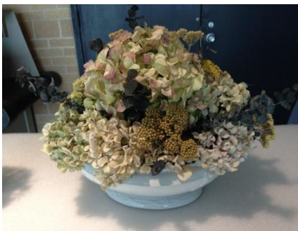
Arrangement for a coffee table