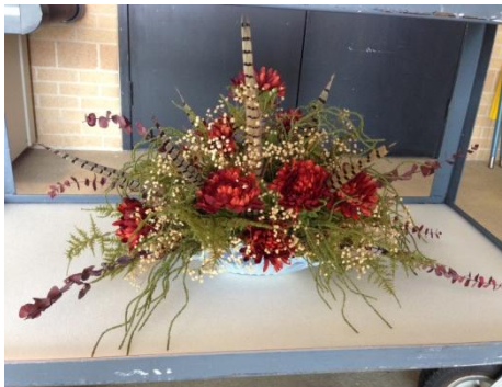
Arrangement for china cabinet