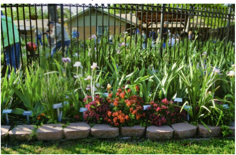
The Nichols Home Garden at the 2013 SLI Convention

When the SLI returns to Dallas for their annual Spring convention in 2017, visitors should be able to view many re-selected Louisiana seedlings and first year seedlings.