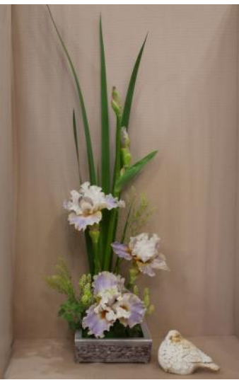
Class 2-Birds of a Feather 3rd Place-Bill Calhoun