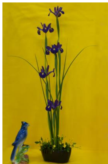
Class 2-Birds of a Feather 2nd place-Dan Cathey