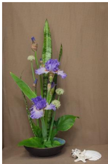
Class 4-Creatures of the Sea 1st place-Bill Calhoun