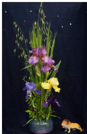
Class 3-Wild & Wonderful (Novice) 3rd Place-Oliver Earl (Youth 5 yrs old)