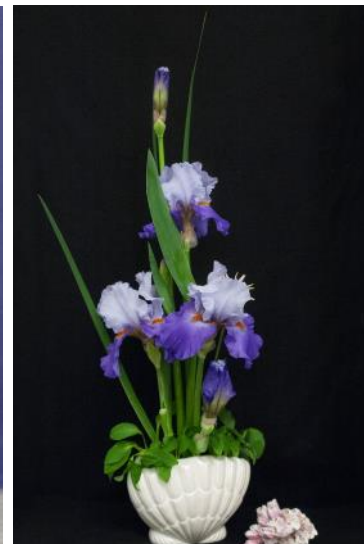
Class 4-Creatures of the Sea HM-Peggy Cathey