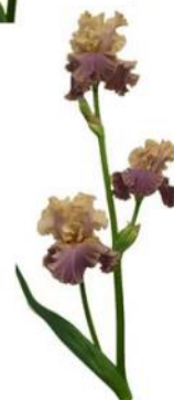
Best Tall Bearded Cosmic Elegance Glenn Huddleston