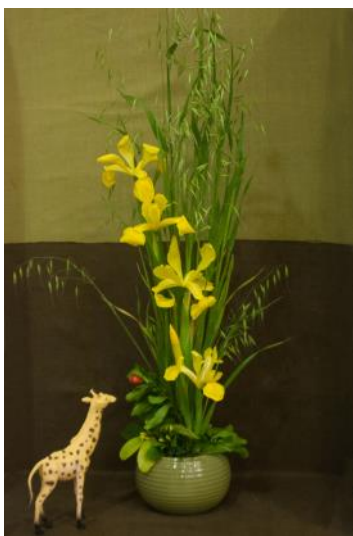
Class 3—Wild & Wonderful (Novice) 1st Place-Frances Peterson