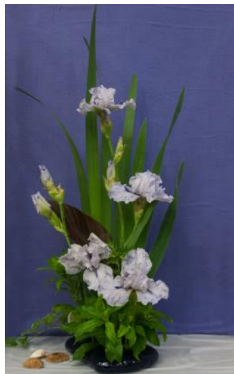
Class 4-Creatures of the Sea 3rd place-Leroy Nabors