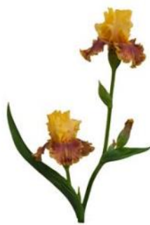
Best Banded Bottle Rocket Glenn Huddleston