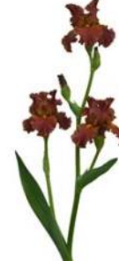
Best Red Far Engine Glenn Huddleston