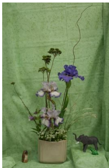
Class 3—Wild & Wonderful (Novice) 2nd Place-Sandra Peterson