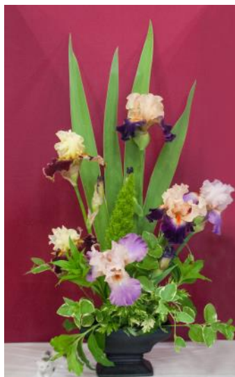
Class 1-Precious Pets 3rd place-Naomi Nabors