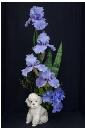
Class 1-Precious Pets, Best of Show - 1st place-Peggy Cathey