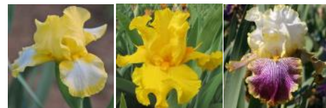
Bottled Sunshine, Glitter Gulch, Gloriafied Glenn