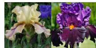
Thornbird, Sharp Dressed Man

There were some old, some new and lots in between! My Thanks to all those who took time to respond. I hope everyone can use this as a reference for acquiring iris for our area.