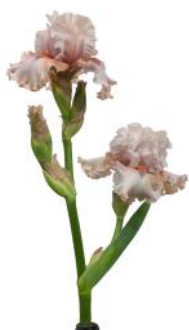
Best Pink Double Platinum Mitchell Whitley