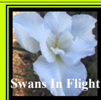
Swans In Flight

Website: http://www.kenfuchs42.net/waco_index.html E-mail: wacoiriss@gmail.com