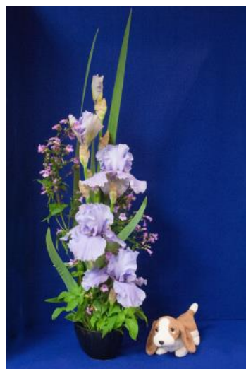
Class 4-Brilliant Blue & Passionate Purple Feeling Blue 1st place & Best of Show—Peggy Cathey