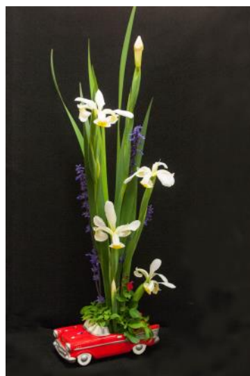
Class 1-Flaming Red & Orange, See the USA in Your Chevrolet , 1st Place—Dan Cathey