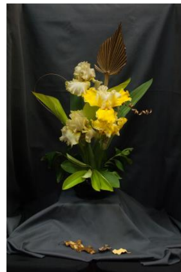
Class 2-Glittering Gold and Yellow Glittering Gold and Yellow 3rd place—Frances Peterson