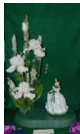
Gone With the Wind

WIS has always used National Flower Show judges to judge our shows. What they look for are simple designs, not FTD® like flower arrangements. Don't over do. (I am bad to keep adding more and more filler—don't do that). I was told to step back and look at your design.