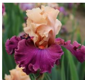
Wrap Her Up Johnson, 2021