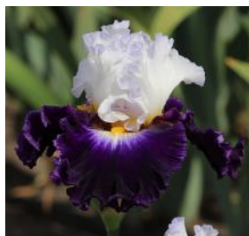
All About Fashion Blyth, 2021