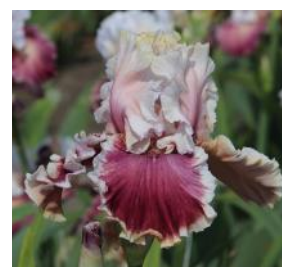
Heart Racer Blyth, 2021