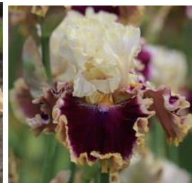
Break My Heart Johnson, 2021