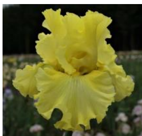
Happy Daydream Black, 2021