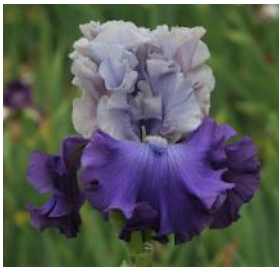
All Grown Up Black, 2021