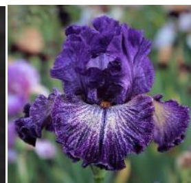
Tracks Of My Tears Black, 2021