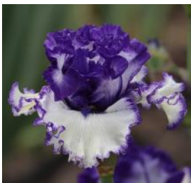
Dot Dash Dot Black, 2021