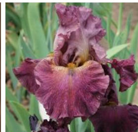
Reticulated Ruby Black, 2021