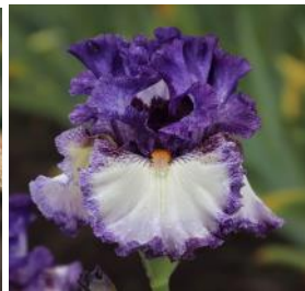
Bespoke Black, 2021