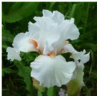
PRESBY HONORS SEPTEMBER Roberts, 2004

BOUQUET MOON BUTTERCUP MORN BUTTERFLY PASTEL CHARM REPLAY CHEREAU SAILOR CONTRAST SEAS CREAM SERENADE DAWN SKIES FROST SONG GLEAM SPARKLER GOLD SUNSHINE