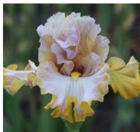
Poetic Dream Blyth, 2021