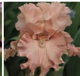
Cross Your Heart Black, 2021