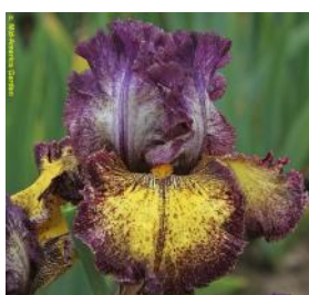
Plc Symphony Black, 2021