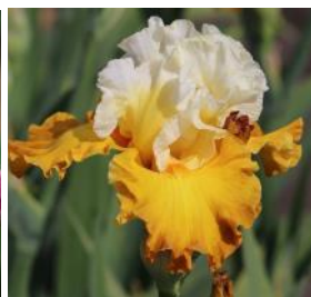
Zip the Moon Blyth, 2021