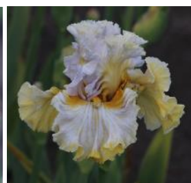
Think Diamonds Blyth, 2021