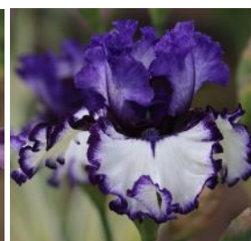
Inked In Blyth, 2021