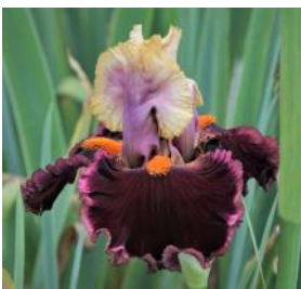
Splash Out Black, 2021