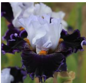
Noble Class Blyth, 2021