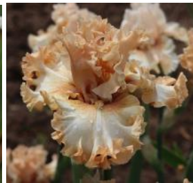
Say the Word Johnson, 2021