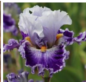
Shout It Out Loud Johnson, 2021