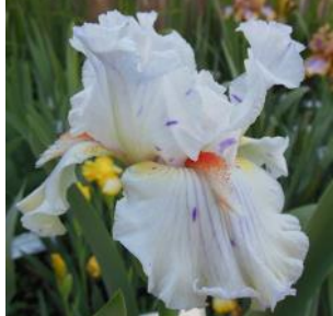
Spring Starter Burseen, 2016