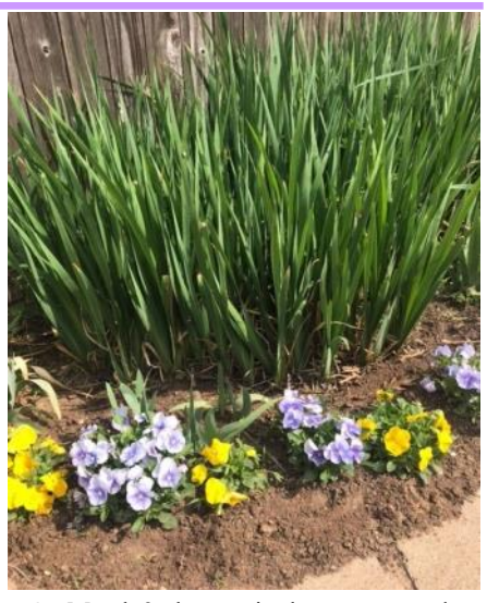
On March 9, the pansies have recovered, and the spurias look fantastic

right after the hard freeze in December. Then there is another picture of how they appeared today, March 9, as I was preparing to write this article. I share these pictures and marvel at the ability of plants to recover. If nothing else, I hope these pictures and this message are a positive reminder that we should never give up on plants. Sometimes they will surprise us. What I did notice about these pansies, especially the blue variety, was that the hard freeze seemed to kill some or most of the top foliage. However, it appears that this damage caused the plants to