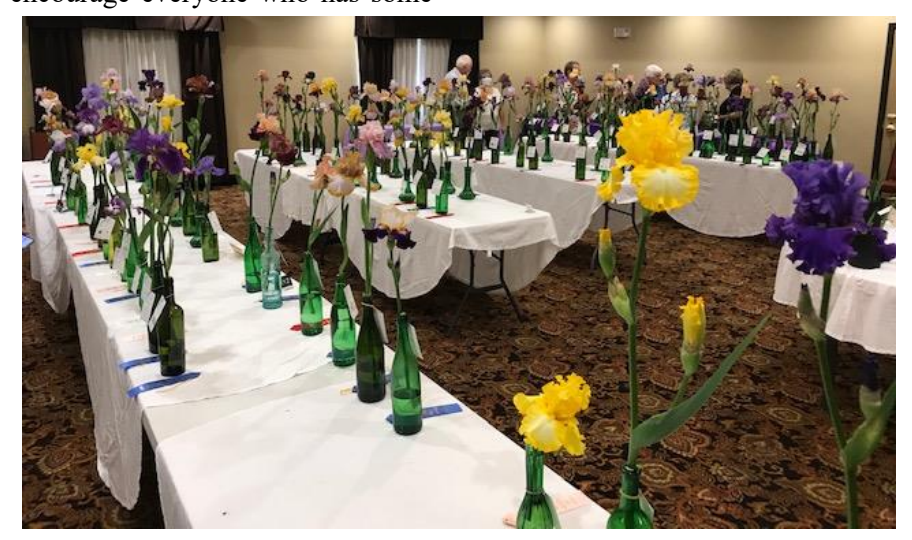
2021 Waco Iris Show-largest show in the Region that year

thing to cut for the show to please bring it and enter it in the horticulture division. Remember, many people come to see the color, variety, and beauty of all the flowers. Whether it gets a blue ribbon, red ribbon, pink or white is really unimportant to the attendees. Let's try to have as many varieties as possible and as many entries as possible and make this a memorable show!