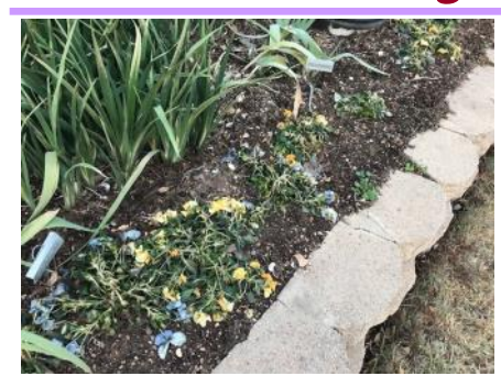
Frozen Pansies and freeze-damaged spuria irises