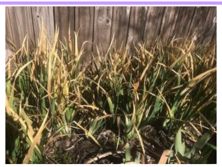
The spuria irises looked even worse a few days after the freeze.

I want to remind you of my message from January. Remember the bleak picture in my article regarding the hard freeze in December? Well, I will again include a different view from the last one. I had planted some pansies in front of a bed of spuria irises. The freeze hit the irises hard, and the pansies looked like they might have been wiped out completely. However, this was not the case. Nature is so amazing. Delicate-looking plants can be much tougher than might be expected. I am including a picture of the pansies