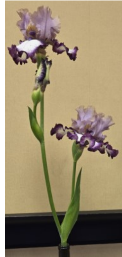
Respect Best Tall Bearded Plicata Mary Keeth