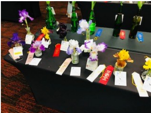
Single Blossom Entries