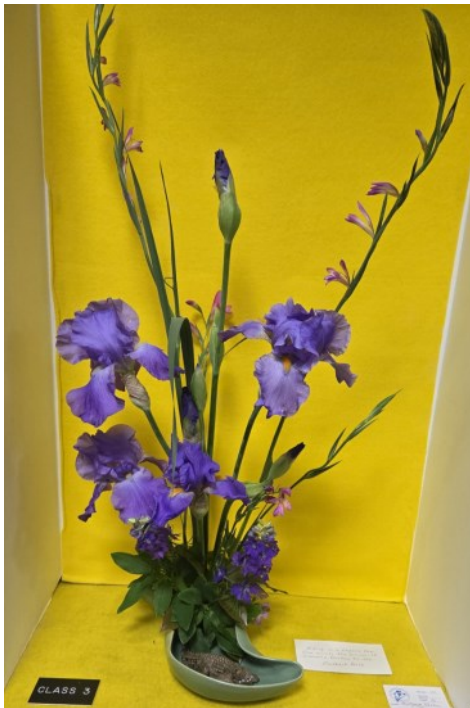
First Place Peggy Cathey