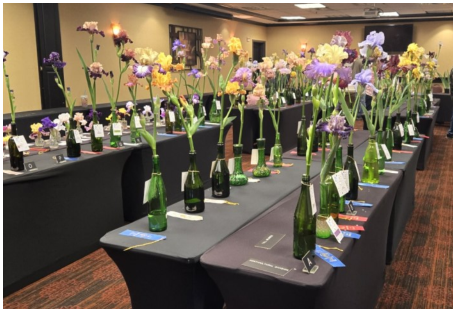
Beautiful Iris—Beautiful Show