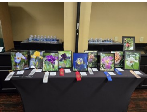
Class 1 Single Blossom