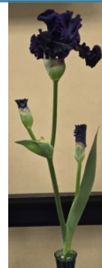
Black Lipstick Best Black Katrina Reiser