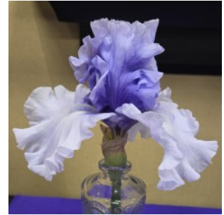
Wintry Sky Best Single Blossom Dan & Peggy Cathey