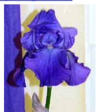
Belton Beauty Frey, 1959

Website: <a href="http://www.kenfuch42.">http://www.kenfuch42.</a> <a href="net/belton">net/belton</a> index.html</a>