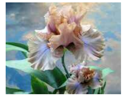
Coffee Trader-2014 Effects HM, Vicki Agee, TX