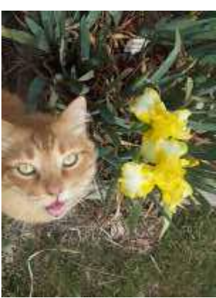
Bottled Sunshine & Tiger, 2014 Youth Wildlife HM. Chelsea Curlee, TX