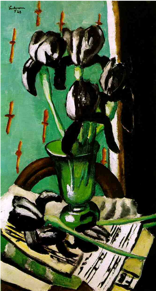
“Black Irises” – A Painting by Max Beckmann

Max Beckmann (1884–1950) was a German painter, draftsman, printmaker, sculptor, and writer. Although he is classified as an Expressionist artist, he rejected both the term and the movement. – wikipedia.org