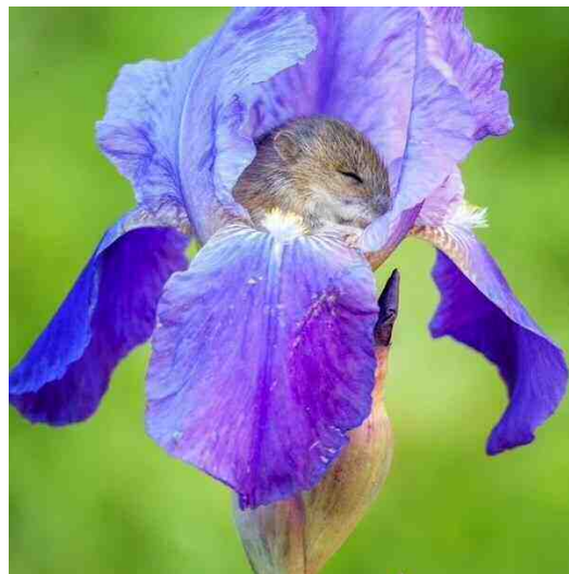
New Iris Bed

Submitted for Approval on: May 10, 2016.