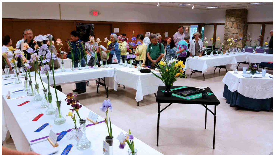
Visitors from Houston/Taiwan