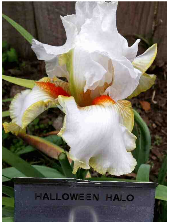
'Halloween Halo' - Weiler, 1990