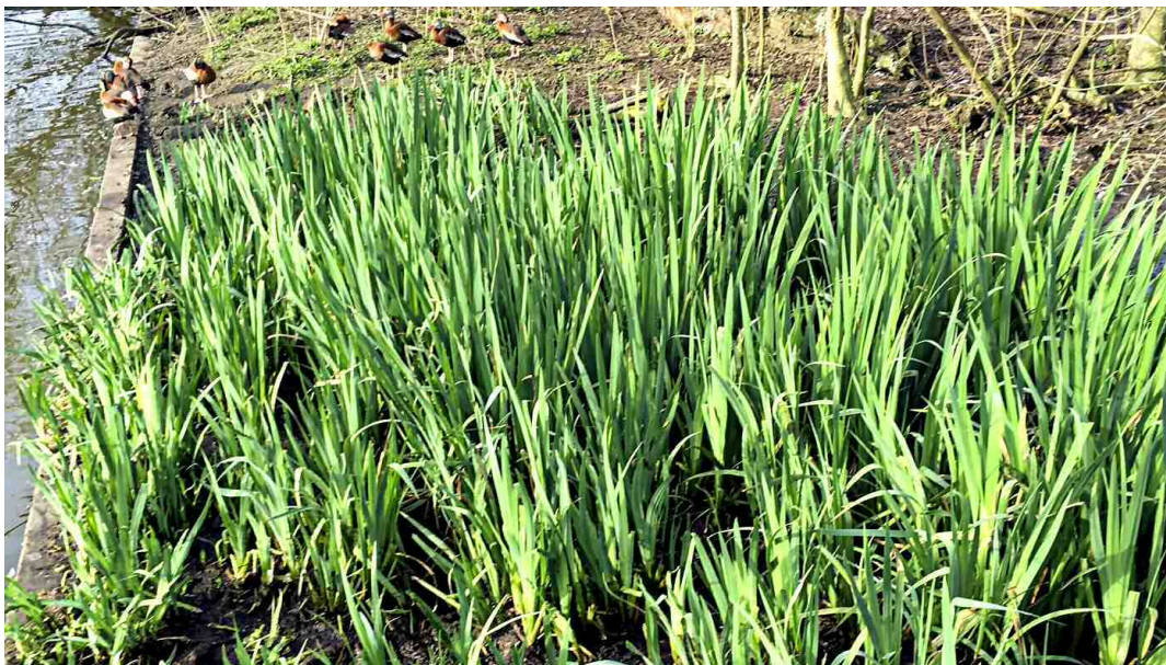
There is a large bed of Louisiana irises on the bank of the pond in Lareniere Park just off a nearby bridge in Metairie.

Submitted for Approval on: March 13, 2018.