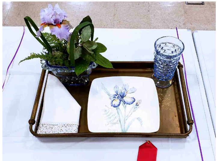
Functional Tray - Nelda Moore