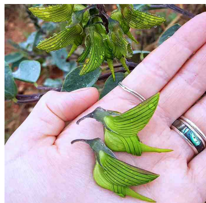
Greenbird flower ( Crotalaria cunninghamii ), a perennial shrub that grows to about 1–3 m in height native to, and widespread, in inland northern Australia