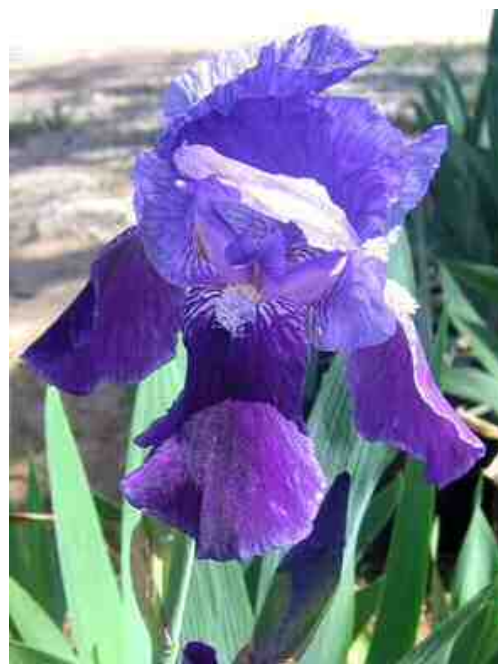
'Dorothea' - Caparne 1901 IB

1901. Child's catalog of 1926 showed a group of these special irises for sale at 35 cents per rhizome. Even tulip type with all standards and no falls came before 'Nth Degree' by Burseen with carnation-like appendages or 'Blue Tulip' a tulip iris by Knocke of El Paso, or 'Pink Magnolia' by Brown 1970 that is a tall