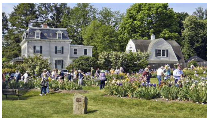
Presby Memorial Iris Garden