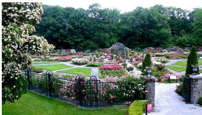
New York Botanical Gardens