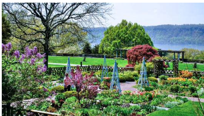
Wave Hill Public Gardens