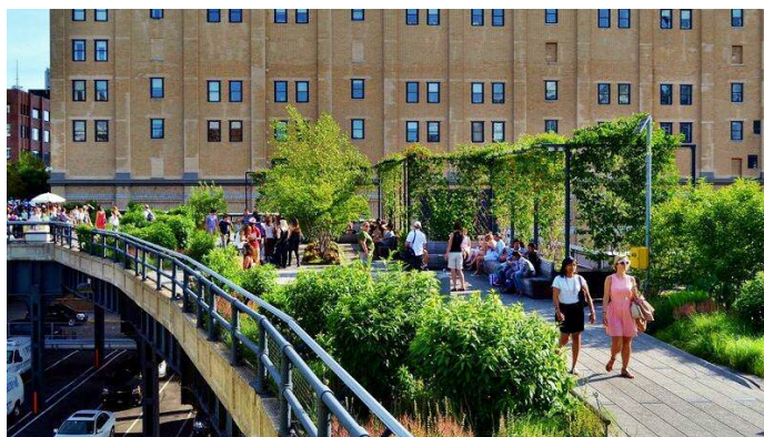
The High Line