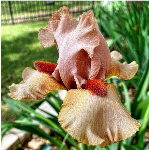
'Tobacco Chew' 2008