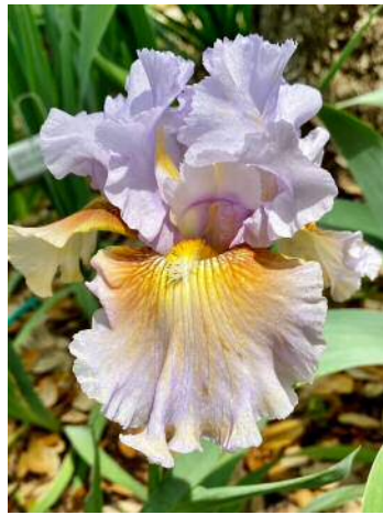
'Cow Palace' 2013