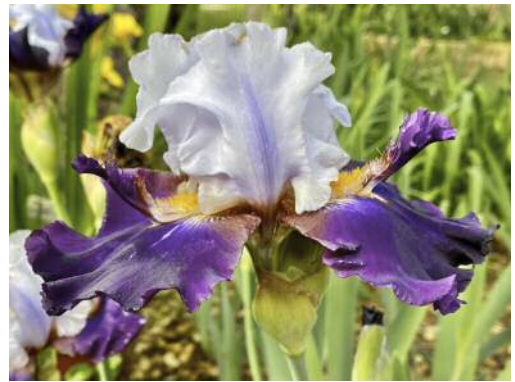
'Behavin Bad' 2010