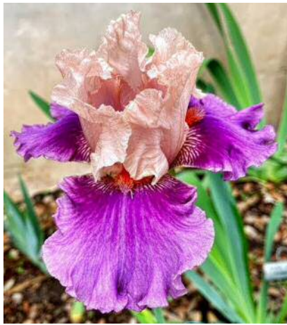
'Church Lady' 2017