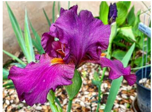
'Hush Diana' 1996