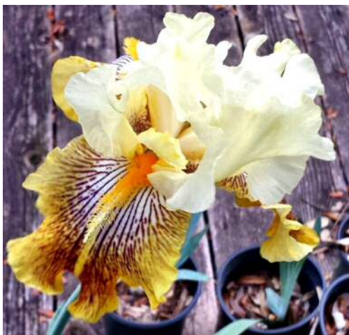
'Western Ways' 2012 (3-19-2020)