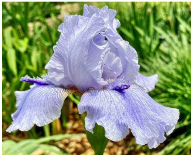
'Ty Blue' 2006