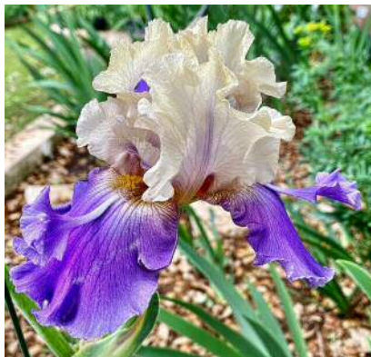
'Cry Me A River' 2006