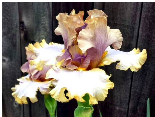
'Hico Huggins' 2014 (3-30-2020)