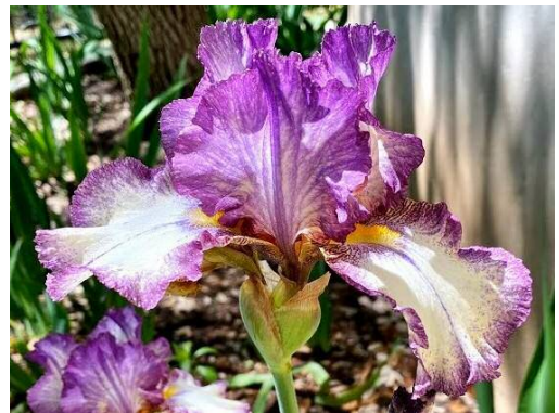
'Say Okay' 1991