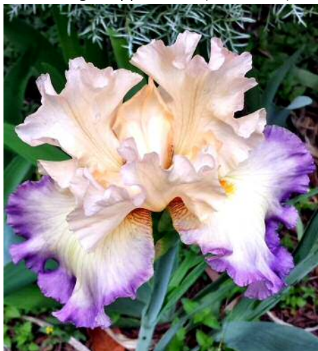
'Ginny Mitchell' Kerr 2013 (3-14-2020)