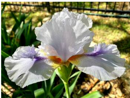
'Ice For Brice' 2003