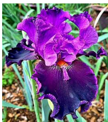
'Happy Eyes' 2013