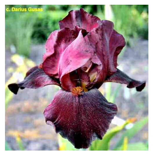
'Cranapple' - Aitken BB 1995

'Bottled Sunshine,' an IB, 'Bundle of Love' a Border Bearded, and 'Cranapple' also a BB do well. One that needs replanting sometimes is 'Batik,' which never has the same markings on the blooms. Each flower is marked differently.