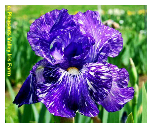
'Batik' - Ensminger BB 1985