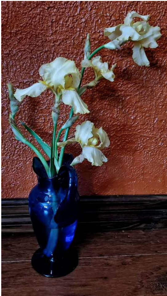
'Jaunty Texan' - bloomed for Ellen Singleton March 19, 2023