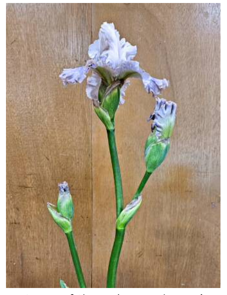
Queen of Show - 'Haunted Heart'