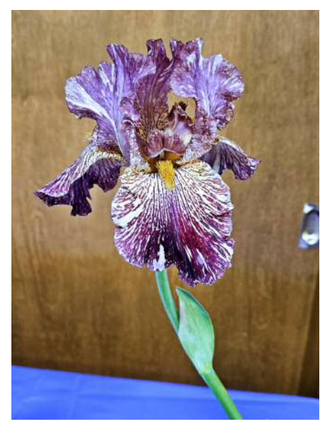
Best Multi-color – 'Bewilderbeast'