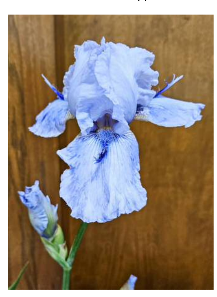
Best Blue – 'Ty Blue'