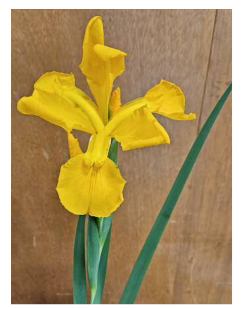
Best Gold – 'Forty Carats'