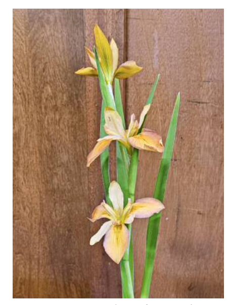
Runner-Up - 'Ride for Dixie'