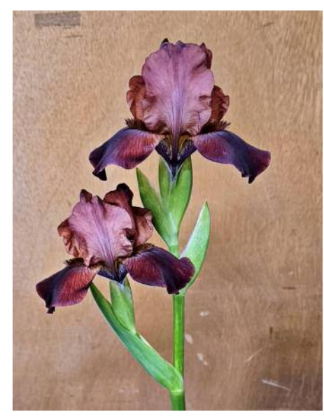
Best Red - 'Cranapple'