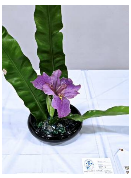
"Clean Water" - Dara Smith