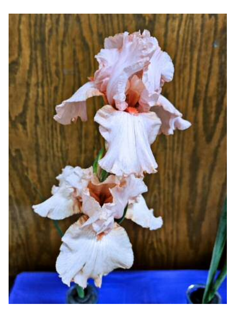
Best Pink – 'Peggy Sue'