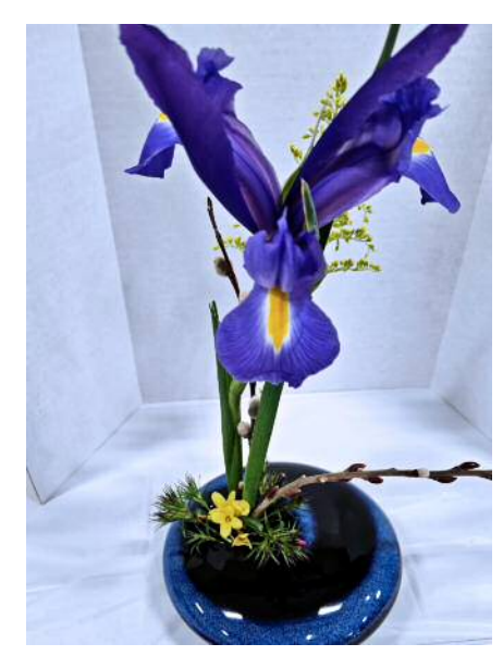
"Clean Water" - Donna Little