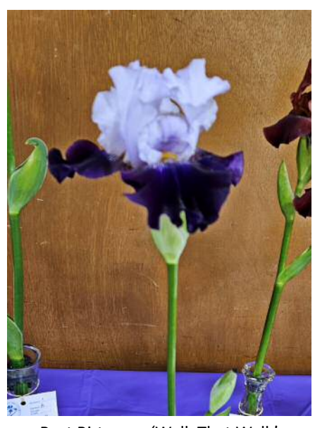
Best Bi-tone - 'Walk That Walk'