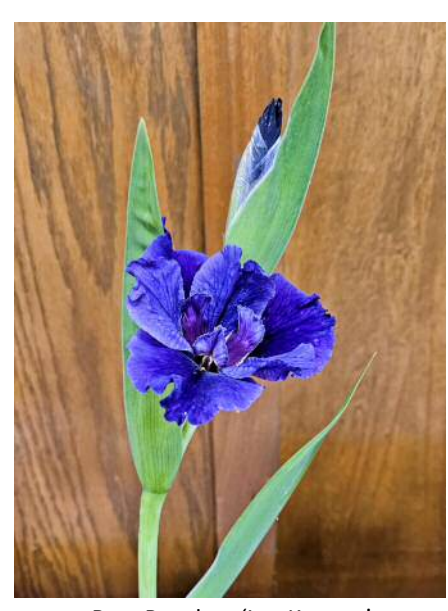
Best Purple – 'Inn Keeper'