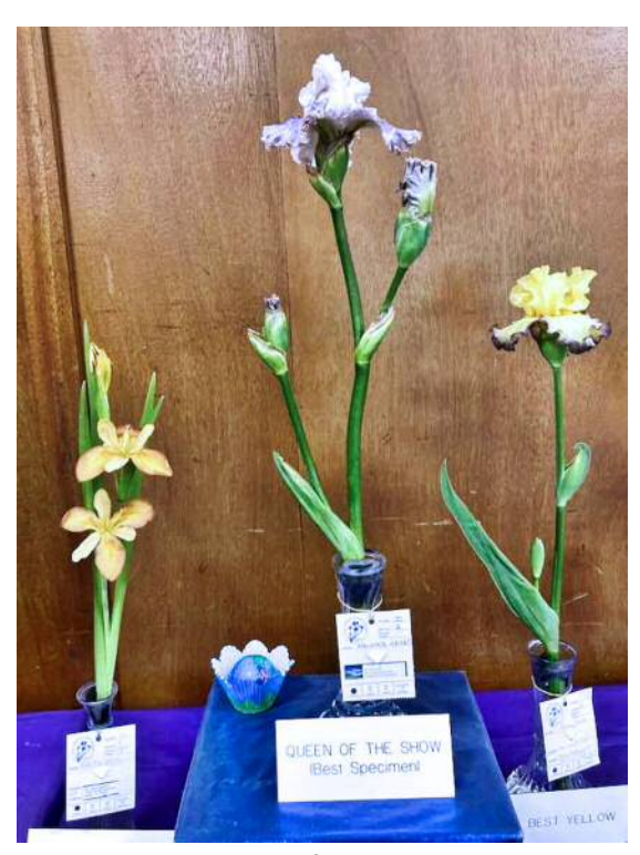
Queen of the Show

Tuesday, May 9 2023 6:30 P.M. Zilker Botanical Garden - Auditorium 2220 Barton Springs Road Austin, TX 78746 POT LUCK