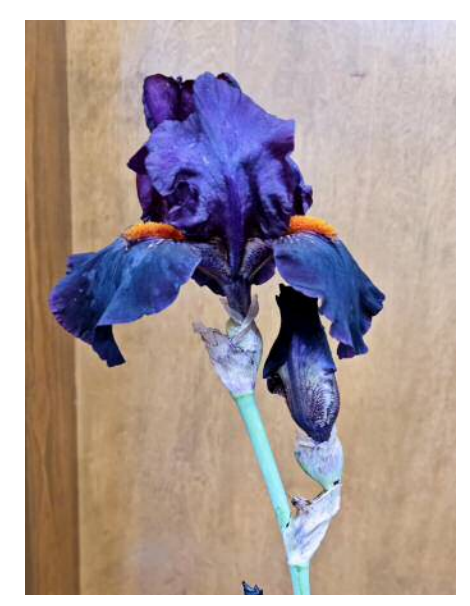
Best Black – 'Dracula's Kiss'