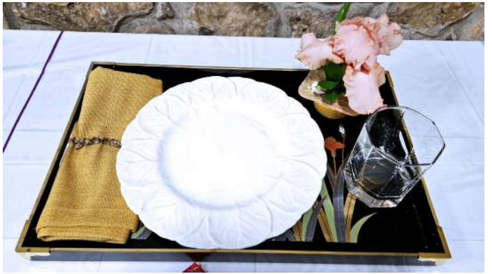
"Irises and Bees" - Tracey Rogers