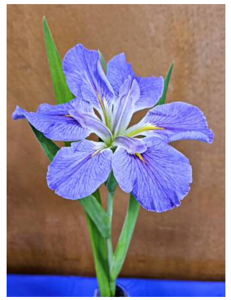
Best Violet – 'Festival Banner'