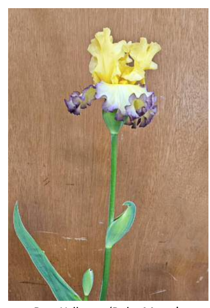
Best Yellow – 'Ruby Moon'