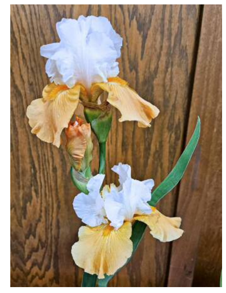
Best Amoena – 'Pumpkin Cheesecake'