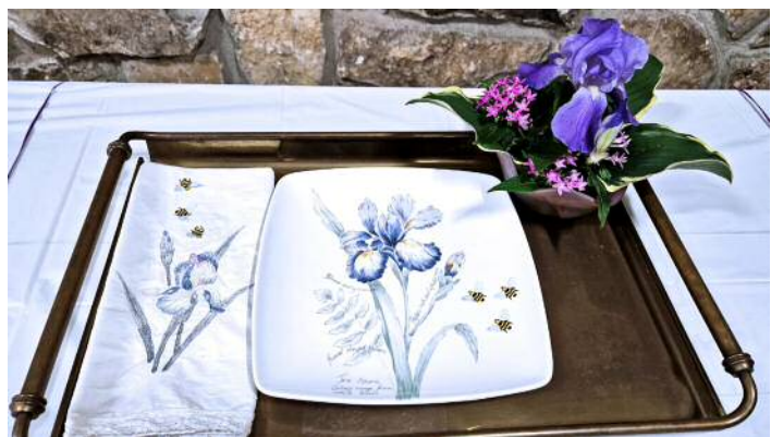
"Irises and Bees" - Nelda Moore