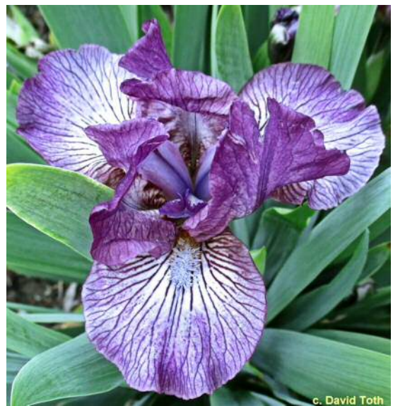
'Worlds Collide' - Toth 2023 SDB