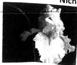
BOMBAY EYES Nichols 2009 – SPACE AGE IRIS

36" Large bubbled ruffled & sculpted flowers are ice flax blue w/sapphire blue triangular area surrounding huge gold & white beards with end in sapphire blue HORNS. Well branched with 7+ buds. Fragrant!