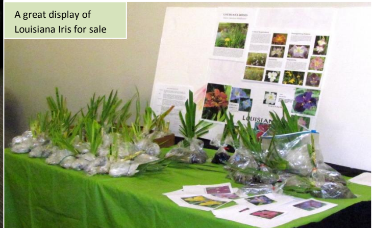
A great display of Louisiana Iris for sale