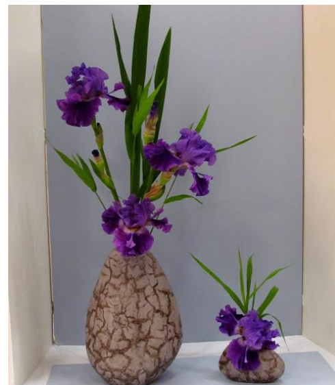
an award-winning design from the 2011 show

For those of you who like lots of flowers in a more traditional arrangement, reserve an entry in the Mass/Traditional Design Class. These arrangements typically have the elements arranged as plants grow with stems down in a source of moisture. Typically large quantities of plant material are used in a closed space with a single fully developed focal area. When using iris in this type of design, be aware that their form may be compromised in a tight