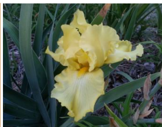
left 'Harvest of Memories' right 'Over and Over' both blooming in Austin in October

September rains in Austin should make this a great year for fall iris blooms.