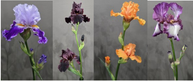
Sassy Sister, Smoldering Fire, Blinded By the Light and Raspberry Frost

Katrina Rieser's entries of Sassy Sister , Best Bi-Tone, Smoldering Fire , Best Black, Blinded by the Light Best Orange, Raspberry Frost , Best Plicata.