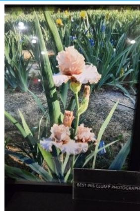
Sect. B. Iris Clump Graceful Show Best of Section-Dawn Holmes