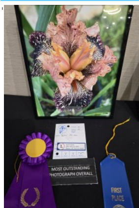
Sect. A- Single Iris Ichi Alien Best of Show-Carol Lane