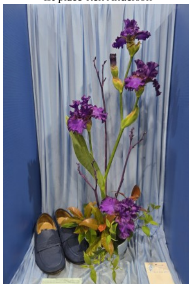
Class 2-Rock and Roll- Blue Suede Shoes 1st place-Ken Anderson Best of Show