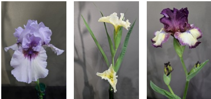
Perry Dyer, Lemon Sorbet and Spiked