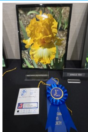
Sect. A- Single Iris What A Beauty Best of Section-Carol Lane