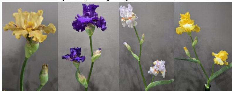
Go Berserka , Tango in the Night , Don't Doubt Dalton and That's All Folks