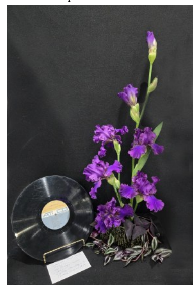
Class 2-Rock and Roll- Deep Purple 3rd place-Dan Cathey