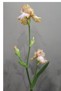
Molokini , Pixel Hue and User Friendly