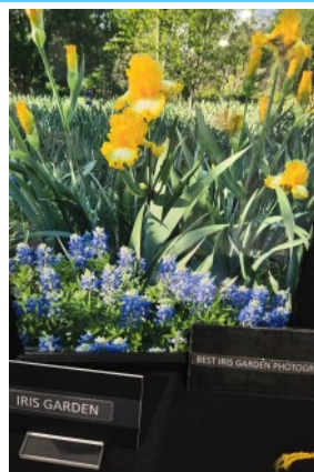
Sect. C. Iris Garden Melody of Spring Best of Section-Dawn Holmes