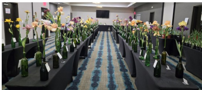
Horticulture entries all lined up and ready to be judged

Here are some of the details of the 2025 show, a testament to the unwavering dedication of our members. We had 11 exhibitors who presented 126 entries, showcasing 113 different cultivars. The variety was impressive, with Tall Bearded, Border Bearded, Intermediate Bearded, Arilbred, and Louisiana irises on display. Six cultivars were entered as Historic, and twelve were entered as Space Ager or Novelty. In addition to these entries, we had five Single Blossom entries, a testament to the diversity of our members' interests. These Single Blossom entries are not reported on the official report nor counted when determining the awards for Silver and Bronze medals, but they are a valuable part of our show.