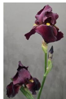
How Now Brown Cow , Irish Butter and Ida Red