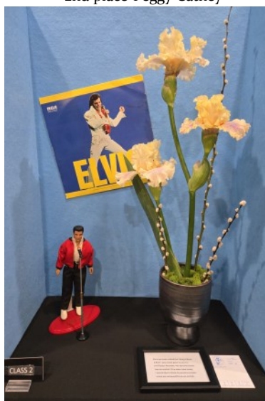
Class 2-Rock and Roll- Elvis 2nd place-Carol Lane