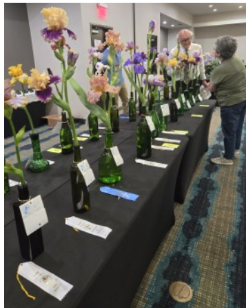
Judging in progress