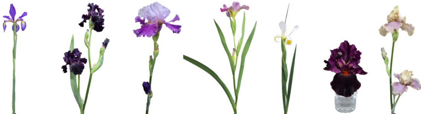
(L-R) Queen of Show-SPU-Rodeo Blue, 1st Runner-up-TB-Yosemite Nights, Nov/SA-Catheys Can, LA-Popsie, Spec-Species orientalis, Single Blossom-Black Magic Woman, Texas Hybridizer-Ozone Alert