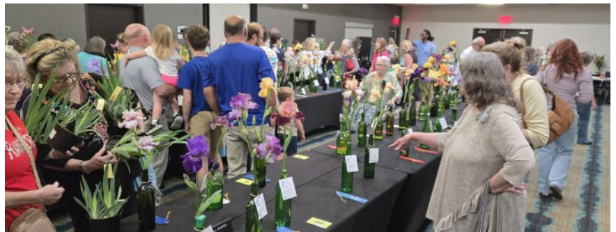
Open to the public