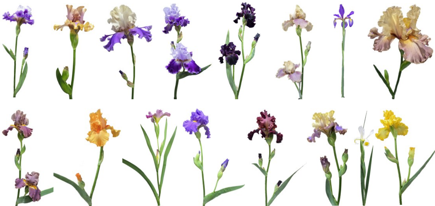
(Top to bottom, l-r) Amoena-Harley Jolly, Banded-Get Social, BiColor-Cry Me a River, BiTone-Shout Out Loud, Black-Yosemite Nights, Blend-Ozone Alert, Blue-Rodeo Blue, Brown-Brown Down, Gray-Cow Patty, Orange-Bahama Mama, Pink-Popsie, Purple-Textronics, Red-Blackberry Tort, Variegata-Repertoire, White-orientalis, Yellow-That’s All Folks.