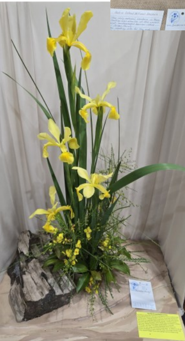
Artistic Design entries—Class 4 -Seashores and Beaches winner “ Padre Island National Seashore ” entered by Peggy Cathey was also Best of Show.