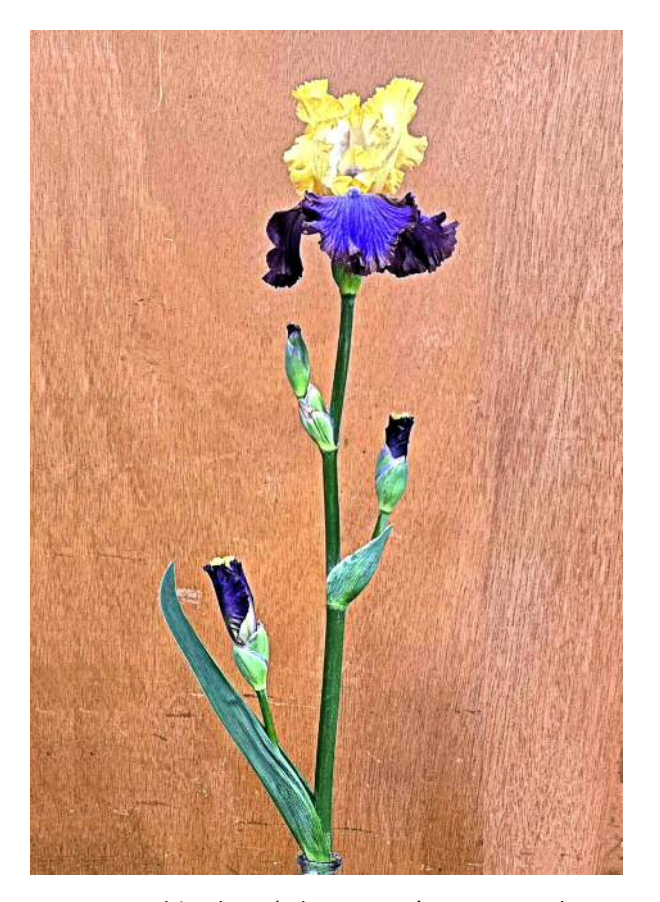
Best Multi-color – 'Adventurous' – Donna Little