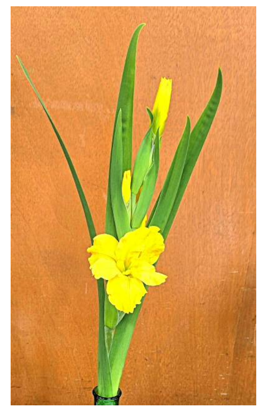
Best Yellow, Best LA – 'Lemon Zest' – Donna Little