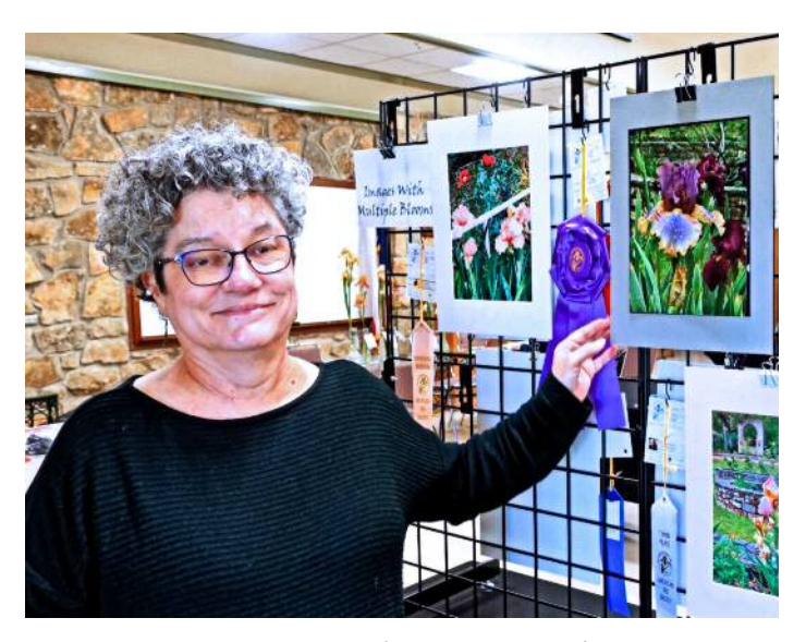
Best Photograph in Section – 'Multiple Blooms' – Tracey Rogers