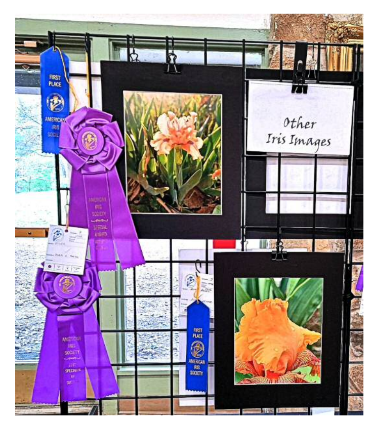
Best Photograph, Best in Section – 'Other Iris Images' – Dara Smith