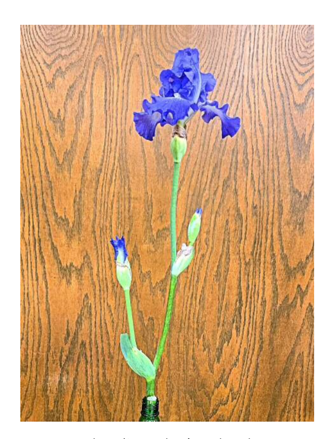
Best Blue – 'Sugar Blues' – Jacky Roberts