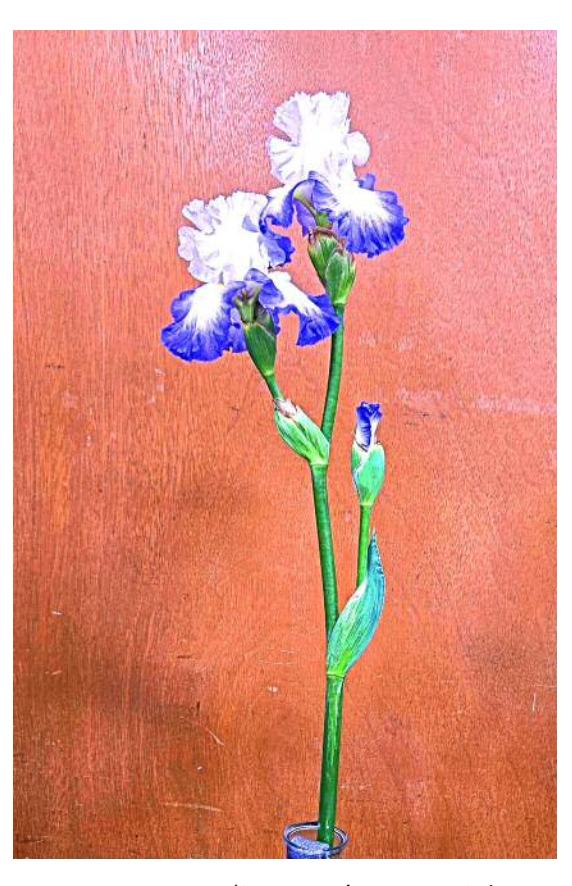
Best Amoena – 'Snow Day' – Donna Little