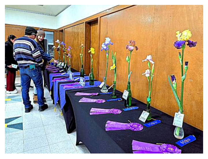
The Head Table