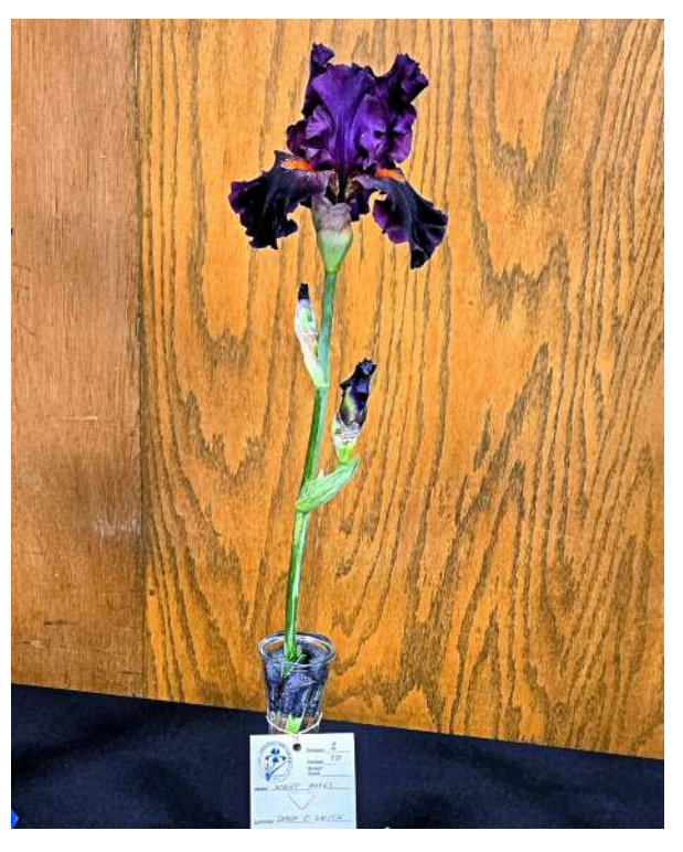
Best Black – 'Night Moves' – Dara Smith