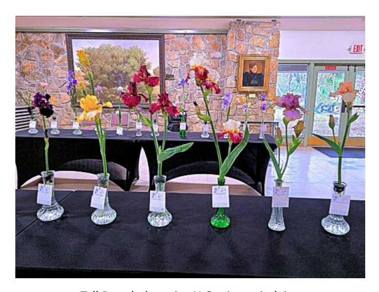
Tall Bearded entries N-S prior to judging