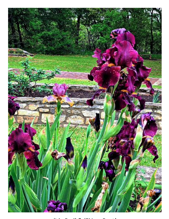
'Ida Red' & 'Skip a Beat'