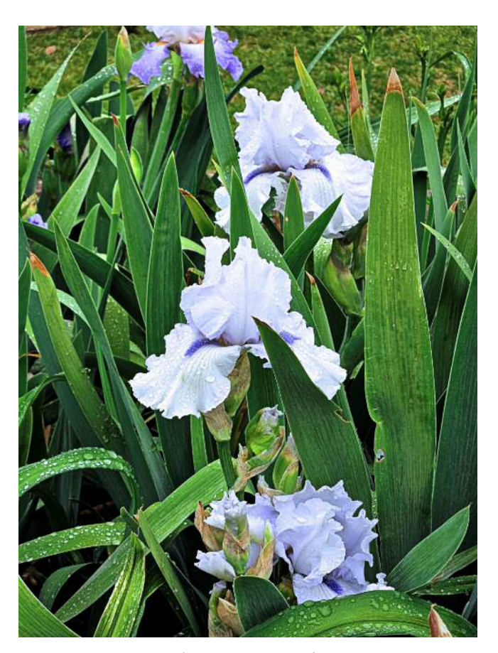
'Austin City Blues'