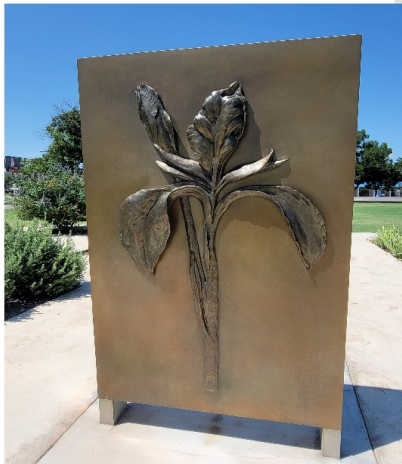
Iris Society of Austin Members at Pug Deavenport Parris Centennial Garden