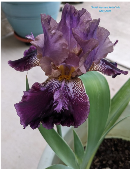
Iris 'Smith Named Keith' (left) blooming May 2025