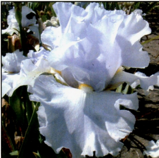
Tall bearded iris ‘March Madness’ (Tom Burseen, R. 2007) (left)