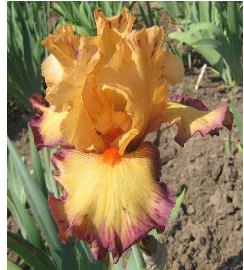
Tall bearded iris ‘Marching Band’ (Joseph Ghio, R. 2005) (right) Honorable Mention 2008