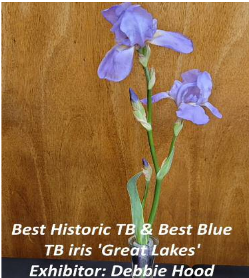
Best Historic TB & Best Blue TB iris 'Great Lakes' Exhibitor: Debbie Hood (left)