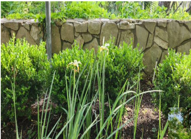
Spuria Irises at Zilker Garden's April 14, 2026 (above & right)