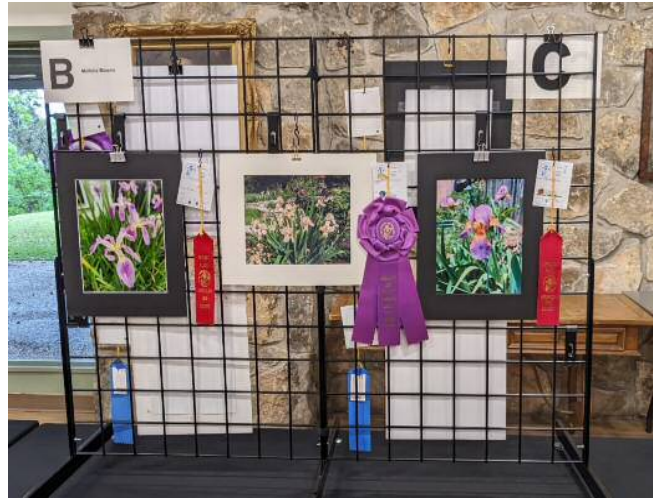
All entries for Photography Section “Multiple Blooms” (above)