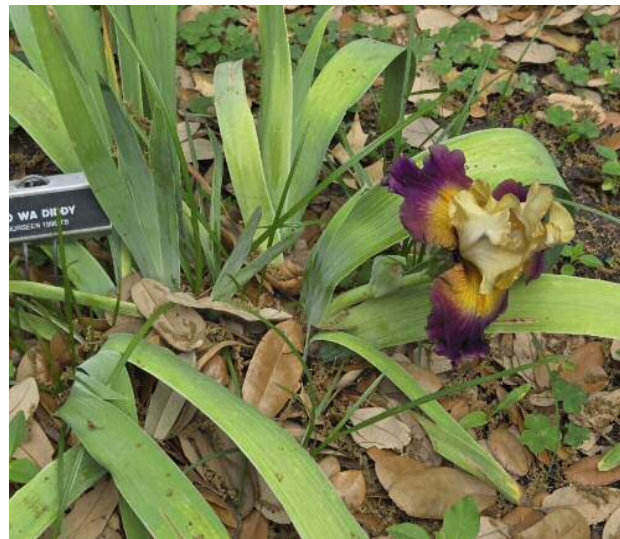
'Do Wa Diddy' (Tom Burseen, R. 1997) in new garden bed at Zilker 3/26/26 (above)