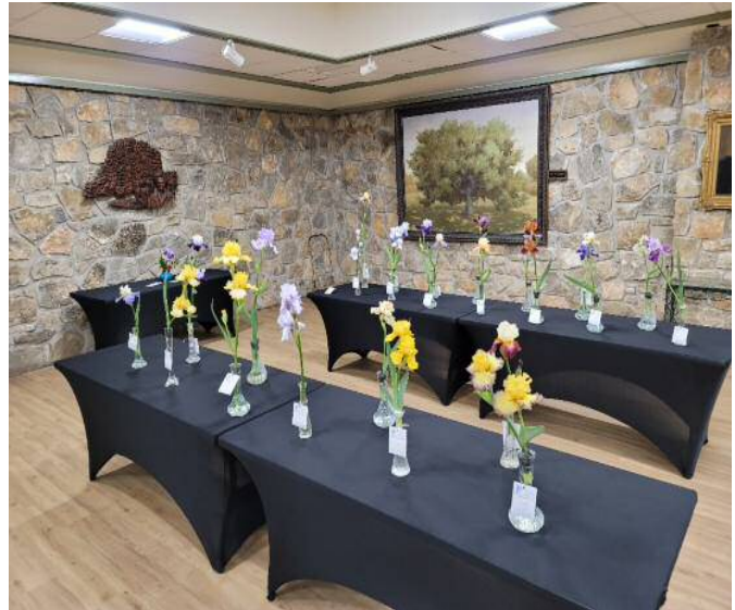
Auditorium with specimens before judging begins (above)