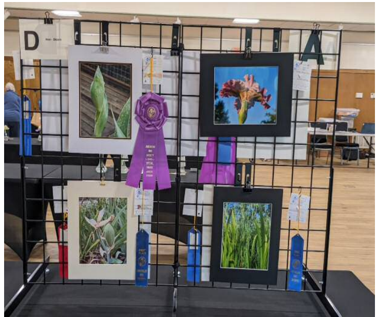
All entries for Photography Section “Non-Bloom” (above)