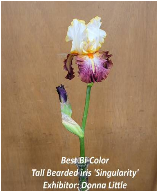
Best Bi-Color Tall Bearded iris 'Singularity' Exhibitor: Donna Little (left)