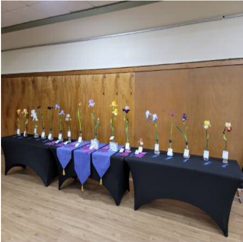
Head table displaying all the winning iris specimens (left)