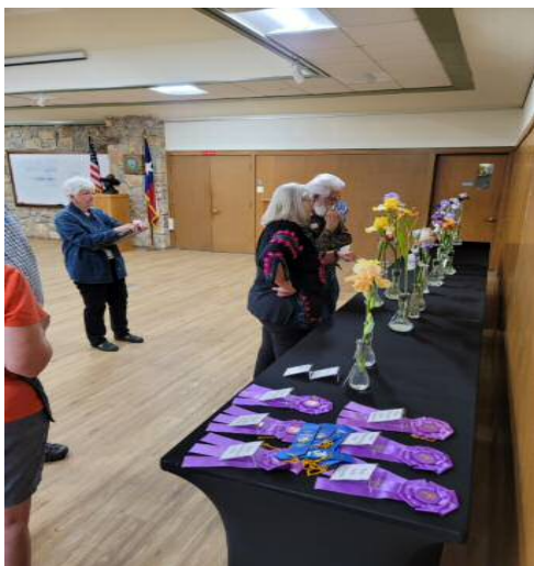
Judges at work (left)