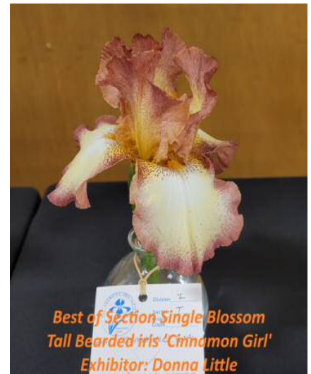
Best of Section Single Blossom Tall Bearded iris 'Cinnamon Girl' Exhibitor: Donna Little (right)