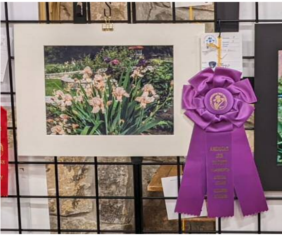
Best of Section (“Multiple Blooms “) Exhibitor: Debbie Hood (above)