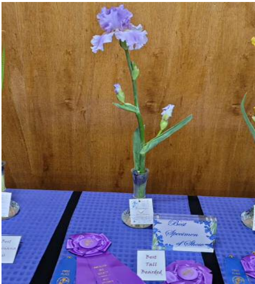
Best of Show & Best Tall Bearded Tall Bearded (TB) iris 'Timescape' Exhibitor: Joyce Evans (left)