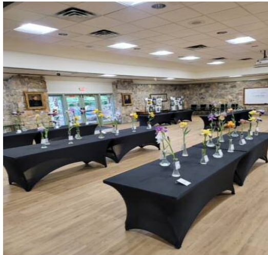
Auditorium with specimens before judging begins (left)