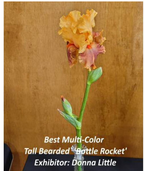
Best Multi-Color Tall Bearded iris 'Bottle Rocket' Exhibitor: Donna Little (right)