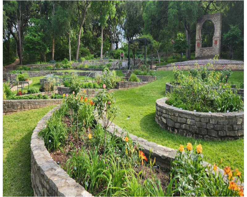
Roses & Daylilies (previously included Irises as well) (above)