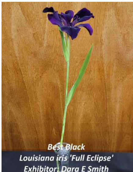
Best Black Louisiana iris 'Full Eclipse' Exhibitor: Dara E Smith (left)