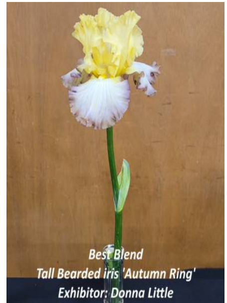
Best Blend Tall Bearded iris 'Autumn Ring' Exhibitor: Donna Little (right)