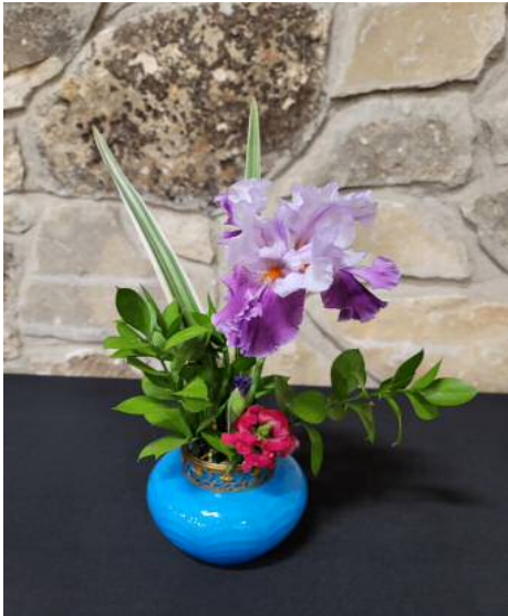
Artistic Design – small design “Rainbow Connection” Exhibitor: Tracey Rogers (above)